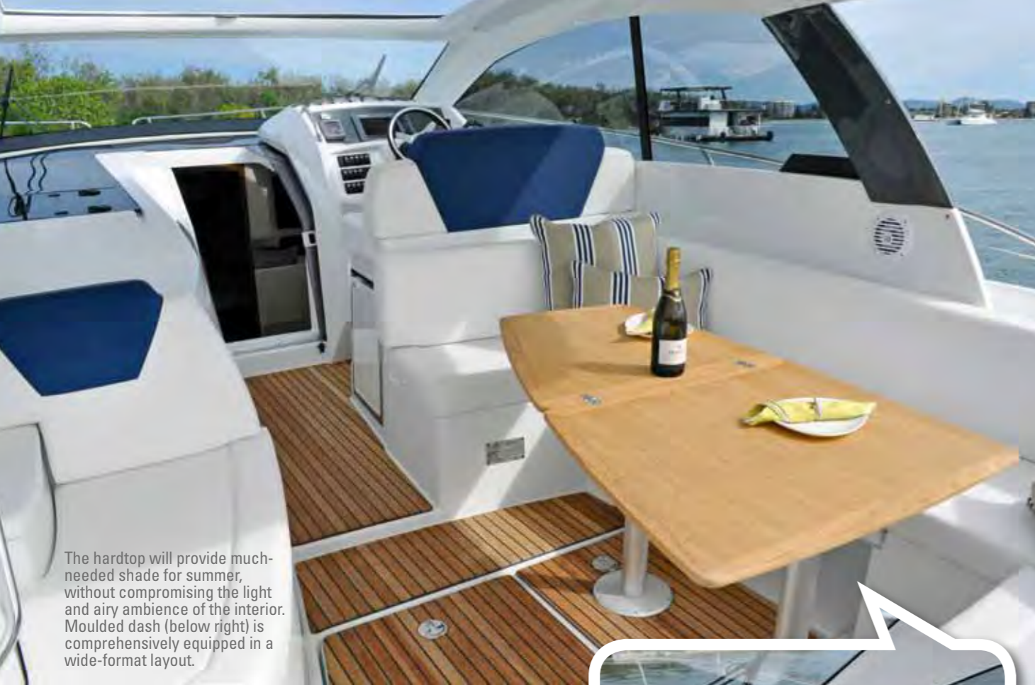
The hardtop will provide much-needed shade for summer, without compromising the light and airy ambience of the interior. Moulded dash (below right) is comprehensively equipped in a wide-format layout.