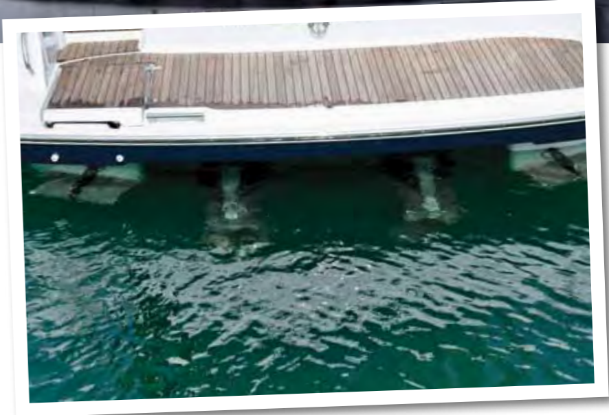
The sunroof (top) is electronically operated, allowing for fine adjustment. Transom is pushed forward within the pared-back hull sides, creating a deep swimstep.

Another thing that appealed was the social aspect of the cockpit layout: the ample lounge and dining area are under cover, while the transom lounge is only partly covered by the roofline for those wanting to catch a bit of a tan. What Jeanneau has also done is to double-up on galley accessories. Instead of having to go below to prepare food and drinks, you have a mini galley on the top-deck, including small fridge and prep-sink.